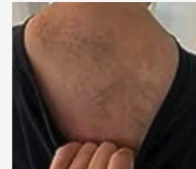
Tinea versicolor fungus infection on back