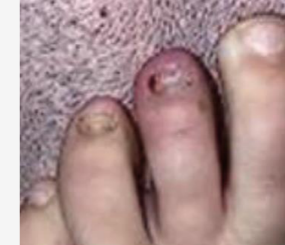
Persistent toe nail fungus infection