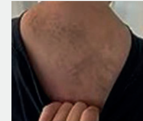
Tinea versicolor fungus infection on back