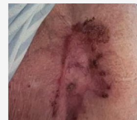
AFTER (4 weeks)