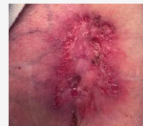
Second degree burn to shoulder area